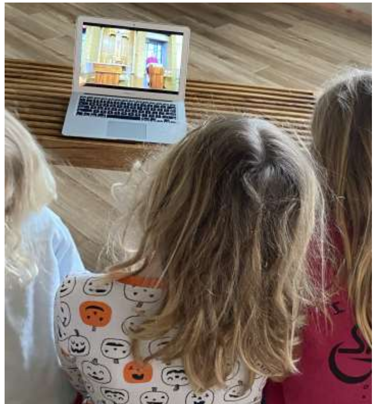
Trinity students watching the Trinity Mass that was live-streamed on Thursday