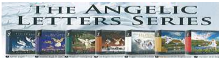
Sold in Holy Grounds & Gifts!

Like us on Facebook! Knights of Columbus Council #9642