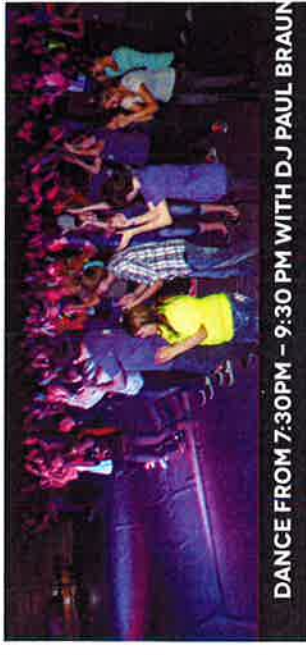
DANCE FROM 7:30PM - 9:30 PM WITH DJ PAUL BRAUN

Two concessions: food concession for between meals and spiritual concession to feed your soul!