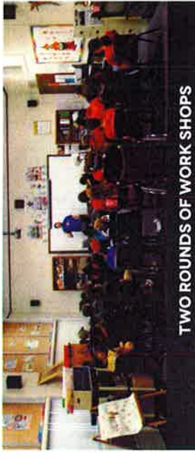
TWO ROUNDS OF WORK SHOPS