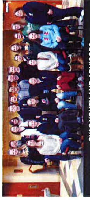
CYAC YOUTH LEAD ADVISORS